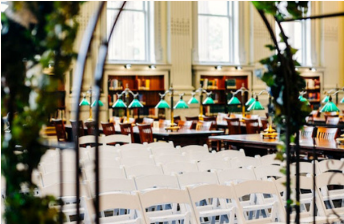
READING ROOM LIBRARY